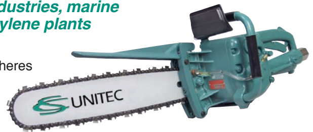
Series 5 1007